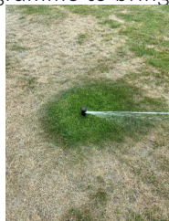
POOR IRRIGATION PRESSURE