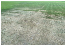
SEVERE HEAT AND DROUGHT STRESS

The pitch was deemed unfit for purpose at the time of inspection. ProPitch detailed an intensive remedial programme to bring the pitch up the required standard.