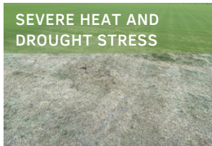
SEVERE HEAT AND DROUGHT STRESS

The pitch was deemed unfit for purpose at the time of inspection. ProPitch detailed an intensive remedial programme to bring the pitch up the required standard.